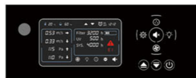
Color Screen Real-time and clearer display of various values and appointment timing function.