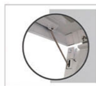
Iron hook support rod for panel support