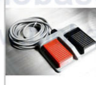
Foot Switch Adjust front window height by foot during experiment, to avoid airflow turbulence caused by arm movement.