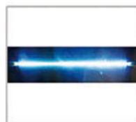
UV Lamp Emission of 253.7 nanometers for most efficient decontamination.