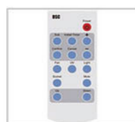
Remote Control All functions can be realized with it, making the operation much easier and more convenient.