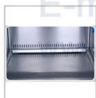
Work Zone Work zone, made of 304 stainless steel, is surrounded by negative pressure.