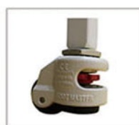
Footmaster Caster Universal caster with brake and leveling feet.