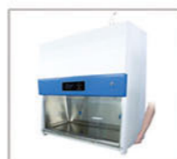
Cabinet Support Block Easy to lift, prevent hand pressing